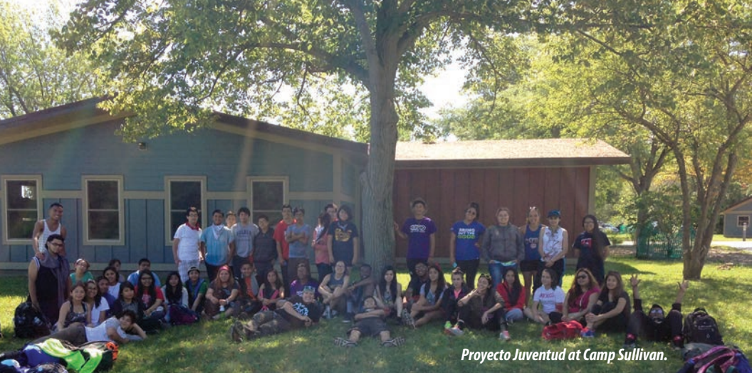
Proyecto Juventud at Camp Sullivan.