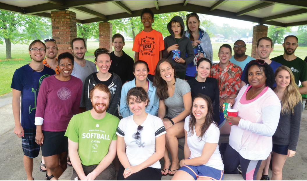
Members of the Young Professionals Association and their guests at a spring fundraising and networking event in the forest preserves that included kayaking and a nature hike.

In early June, the Foundation’s Young Professionals Association hosted an afternoon of kayaking and canoeing on the Little Calumet River in Kickapoo Woods. Before journeying on the river, members and their guests went on a nature walk to explore the surrounding woodlands.