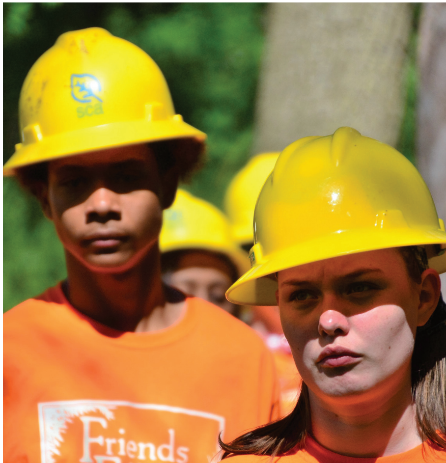
Conservation Corps members listen to instructions from a crew leader.