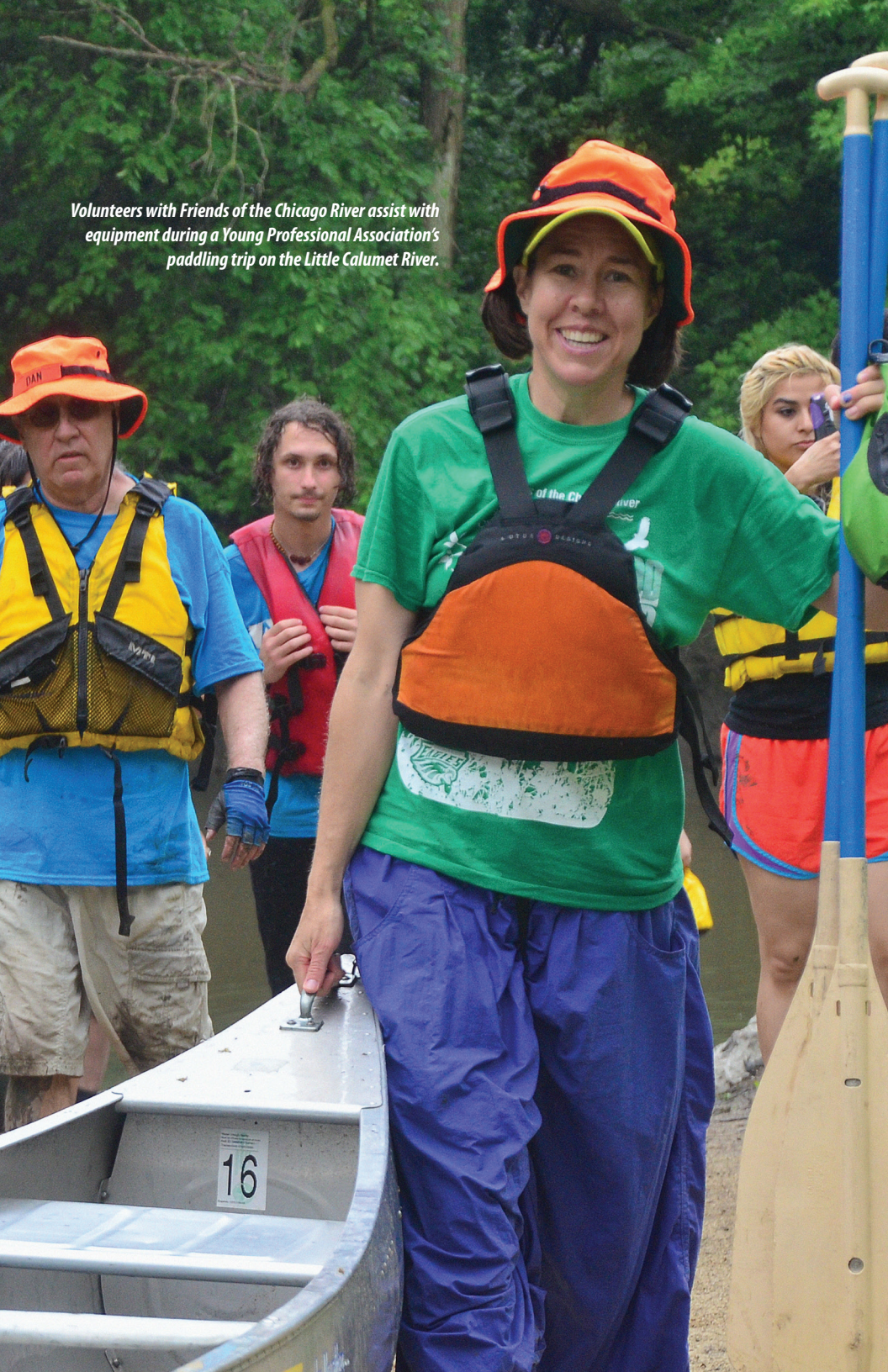
Volunteers with Friends of the Chicago River assist with equipment during a Young Professional Association's paddling trip on the Little Calumet River.