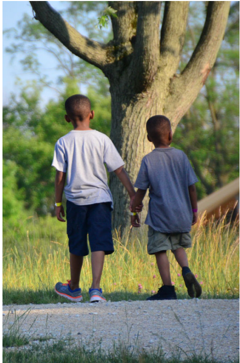
Exploring nature up close at Camp Sullivan in Oak Forest.

Wild Indigo Nature Explorations, a group that organizes free outdoor field trips and activities in southeast Cook County, facilitated the family’s introduction to camping. Wild Indigo’s outreach fellows run the overnight camping excursions.