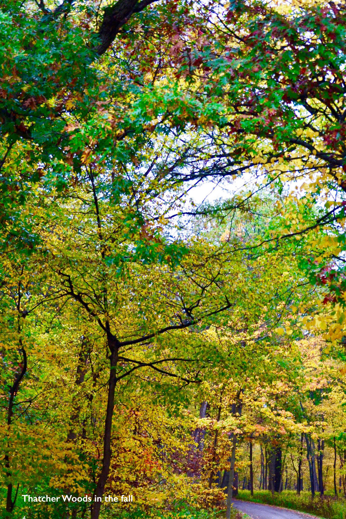
Thatcher Woods in the fall