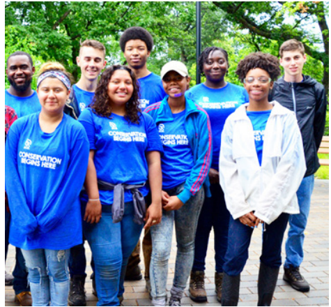
Members of the 2017 Conservation Corps crew supported by the Foundation.