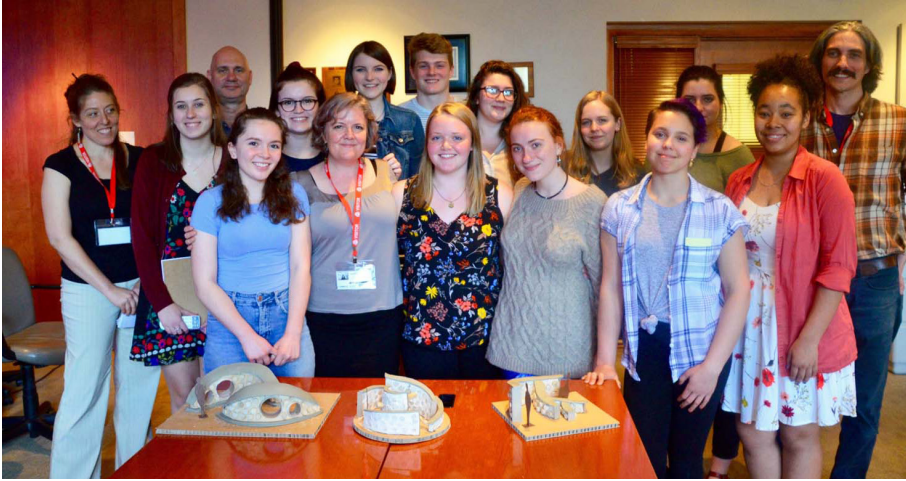
Oak Park River Forest High School art students with their teachers and professional artist advisers display models of the nature-based sculpture they designed.

Twelve art students from Oak Park-River Forest High School worked over several months to design nature-based sculptures for installation outside the Forest Preserves headquarters in River Forest.