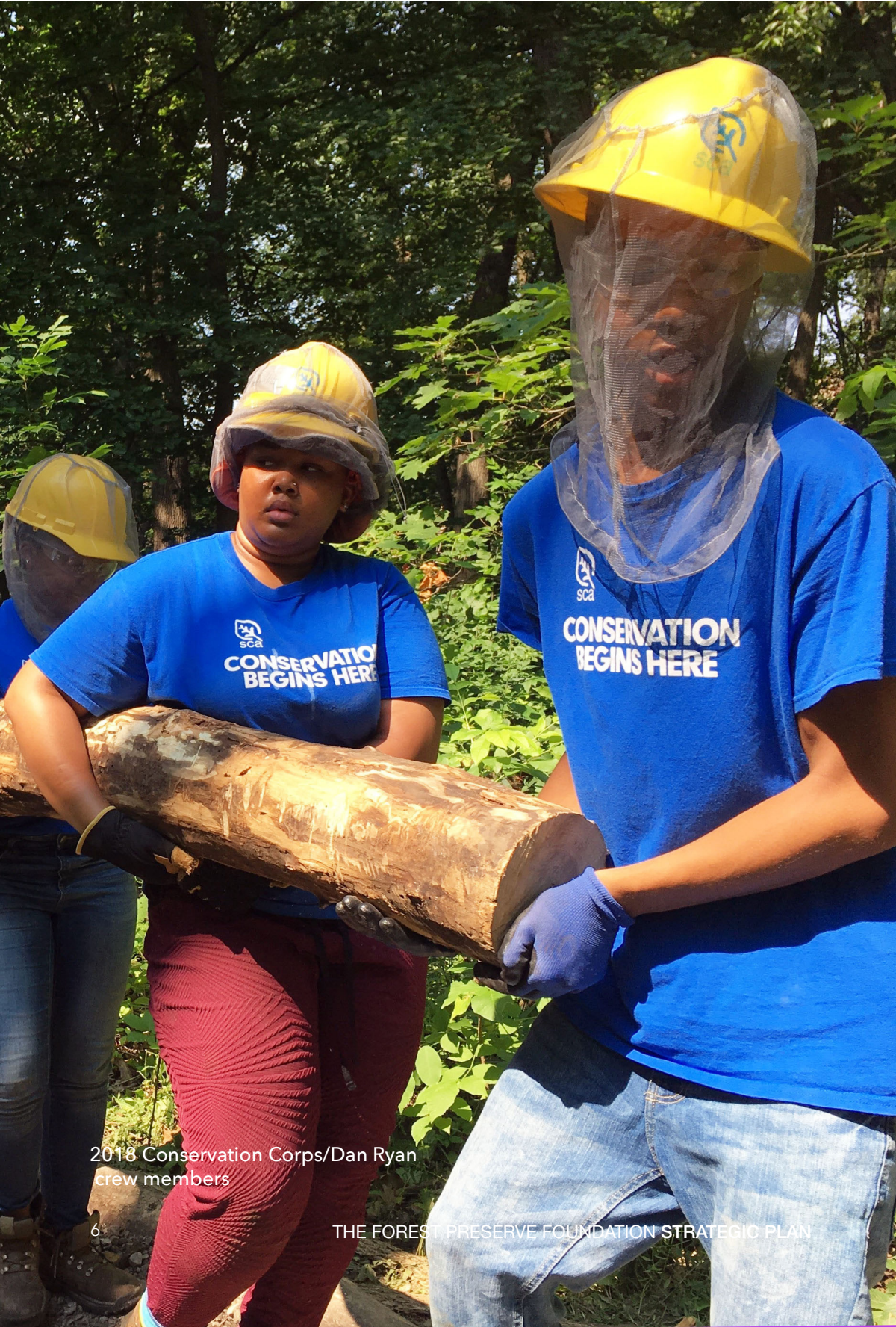
2018 Conservation Corps/Dan Ryan crew members