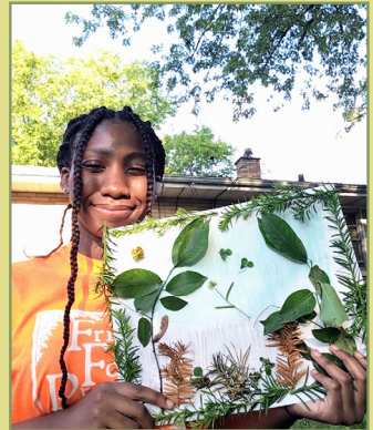
A participant in the Forest Preserve Experience program.

A post-program survey reported that 40 percent of youth have never been to a forest preserve before their participation.