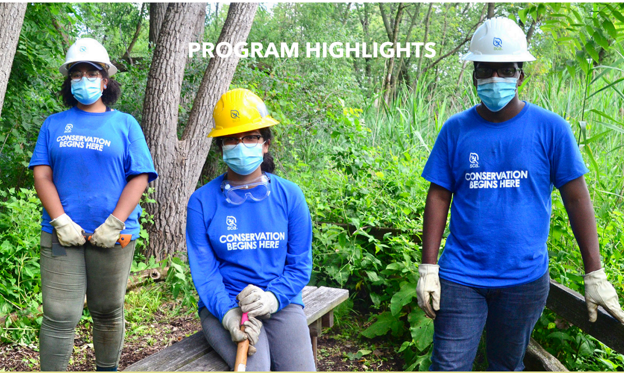
Chicago Conservation Leadership Corps Program crew members at Sand Ridge Nature Center.

The Forest Preserve Foundation provides financial support to two youth conservation programs: Chicago Conservation Leadership Corps and the Forest Preserve Experience, paid summer internships for high school age youth who reside in Cook County.